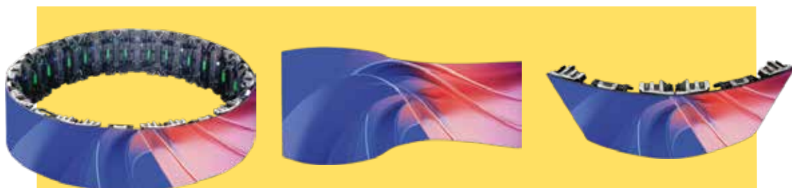
Rental Flexible LED display module configuration examples

The immersive experience provided by flexible large-scale rental LED displays creates visually captivating and memorable environments for events, concerts, exhibitions, trade shows and other large-scale facilities.